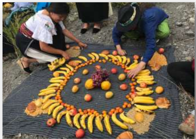
COTACACHI AND TOCTIUCO GARDENS OF LIFE

Pandemic has impacted on Grail women and social justice women who work with indigenous people in Ecuador and are not able to work with them as before. All the usual problems: loss of jobs, more vulnerable are immigrants and refugees.